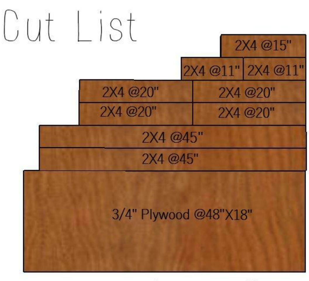
SAWDUST to Sequins