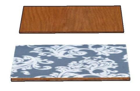
SAWDUST to Sequins

Use adhesive to attach foam backing to the 18"X48" piece of plywood. Lay fabric over the foam and flip over.